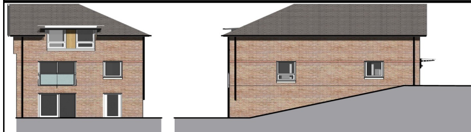
Rear elevation Side elevation