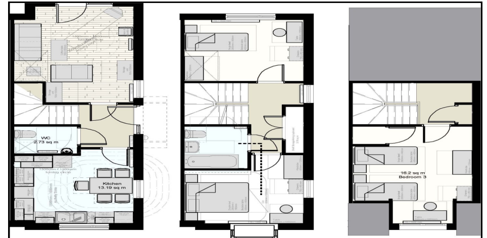
Ground Floor First Floor Second Floor